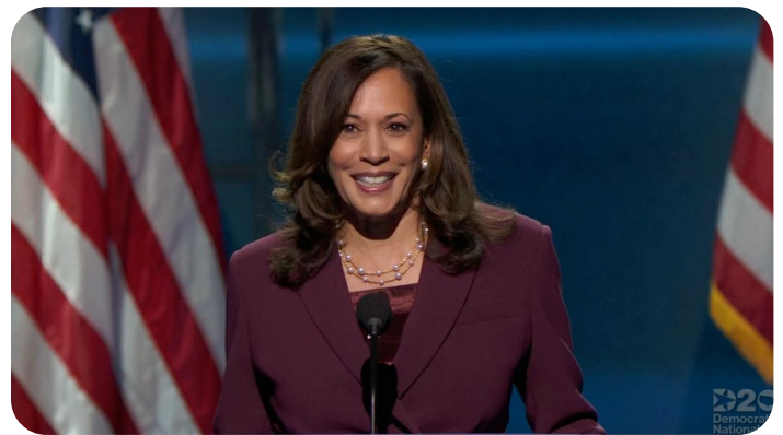
Kamala Harris at the 2020 DNC

Join us as we use this historic moment in time to show our little scholars that they are capable of greatness and renew your pledge to partner with us to ensure their success.